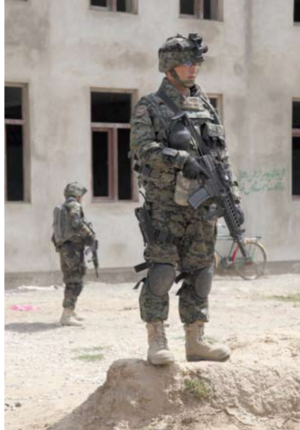
A South Korean service member with the Republic of Korea Provincial Reconstruction Team provides security while visiting Qal-Eh-Khoja village in the Parwan province of Afghanistan, August 31, 2010. The team was visiting the village to inspect a new school under construction.

However, to date South Korea's experience in these areas has been mostly small and has rarely involved facing the kind of threats that would build the kind of military expertise necessary for a North Korean