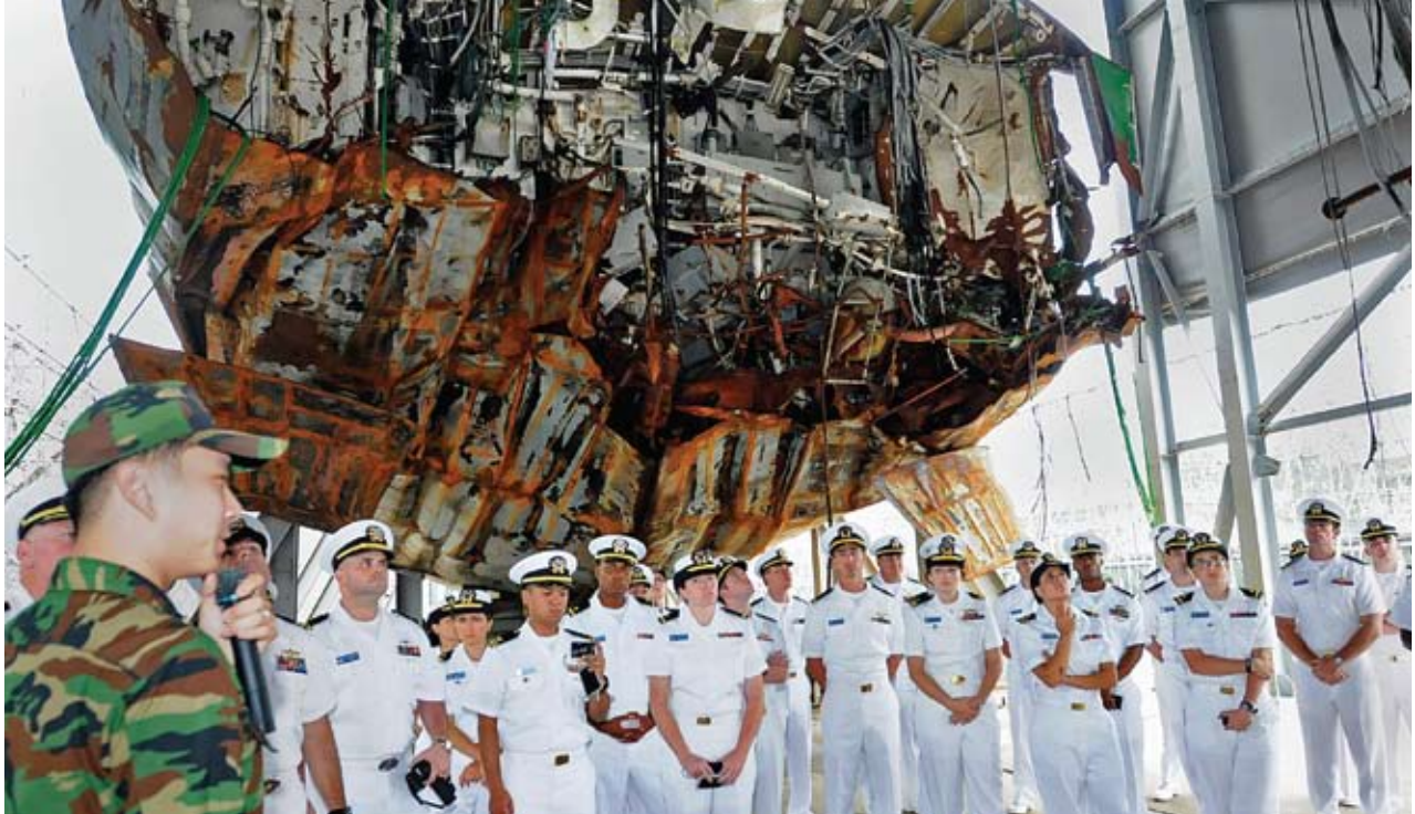
Officers assigned to the U.S. 7th Fleet command ship USS Blue Ridge examine the damage to the Republic of Korea navy corvette ROKS Cheonan . A non-contact homing torpedo exploded near the ship on March 26, 2010, sinking it, and resulting in the death of 46 ROK Navy sailors.